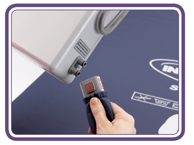
Emergency CPR air release