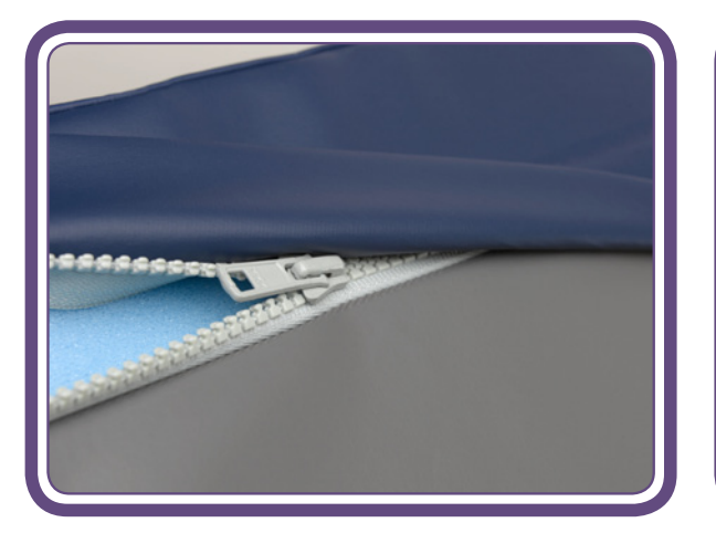
Tough water ingress resistant zip and welded seams

Carry handles reduce WHS related injuries