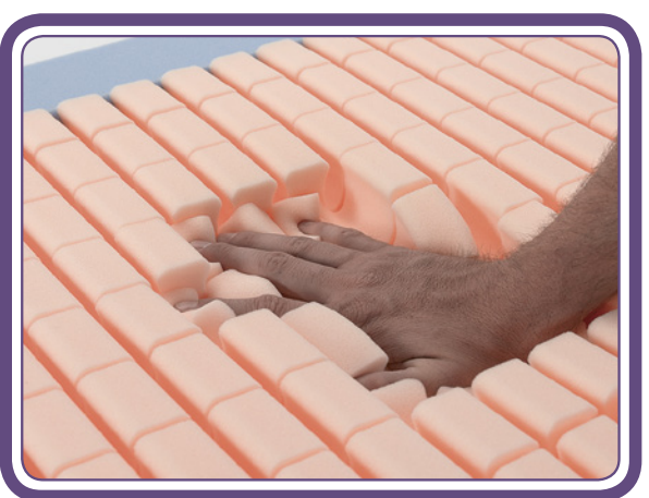
Castellated foam for superior pressure relief